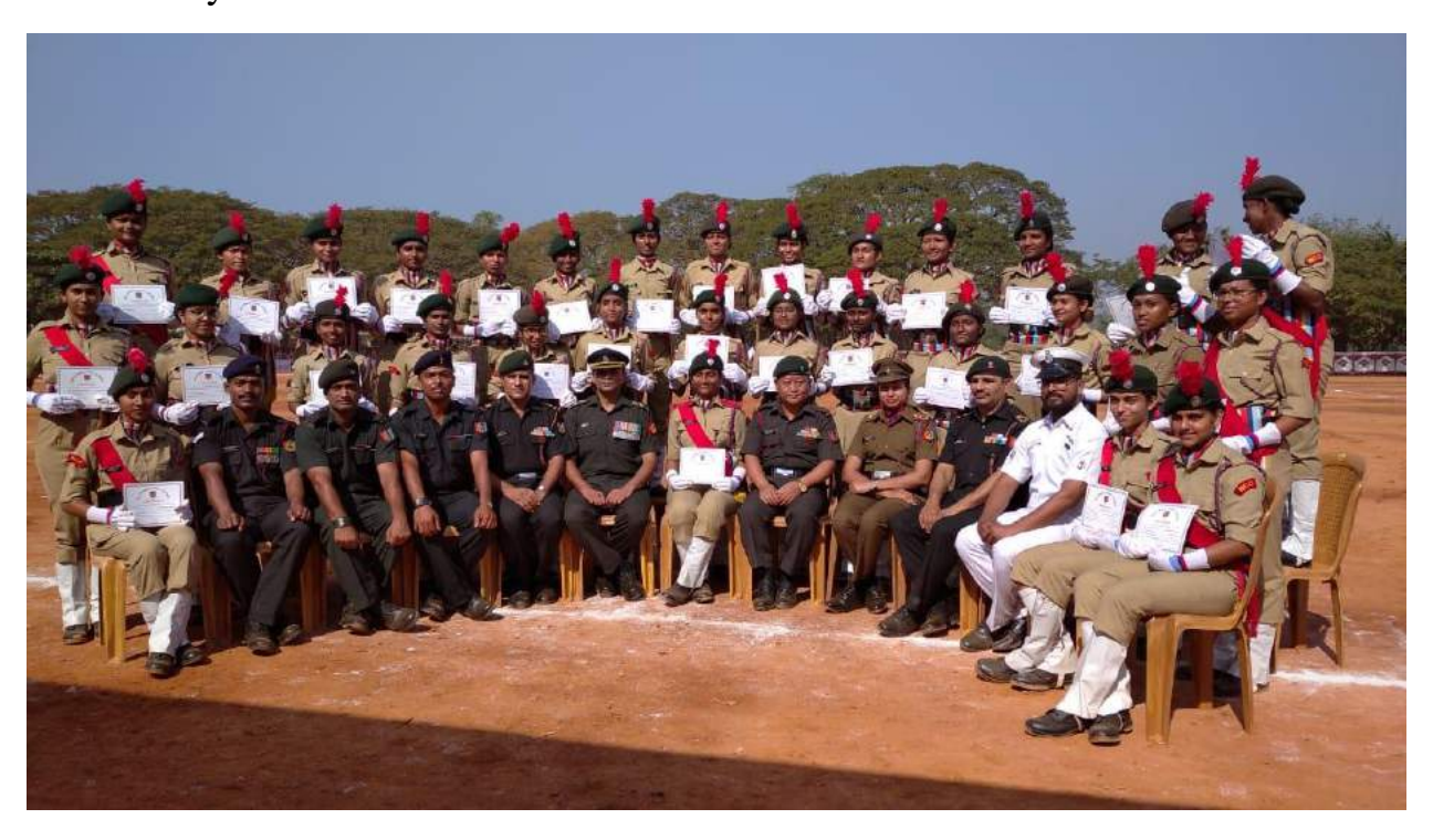
23] 38 Cadets of our college attended Army mela on 13<sup>th</sup> January. Three cadets volunteered during Army Mela to showcase NCC, on 13<sup>th</sup> and 14<sup>th</sup> January 2020.

22] Our cadets also participated in State Republic Day celebration at Campal on 26^{th} January 2020.