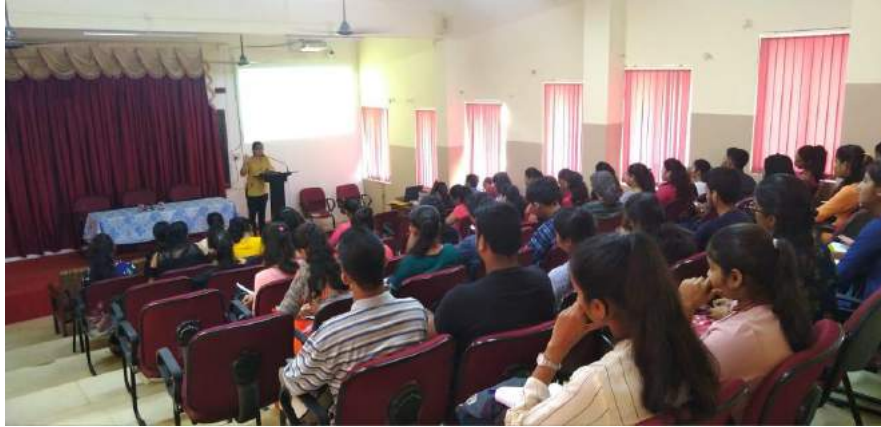
Session on Essential Components of Research at the State-Level Student Workshop on Citation, Referencing and Bibliography as per MLA 8 th edition