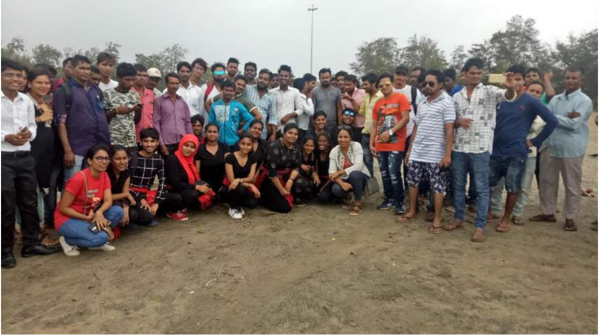
Team with audience at Miramar