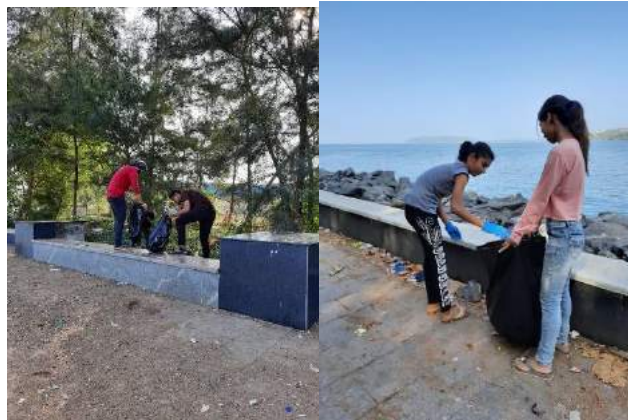
Participants of Pegasus on cleanliness drive