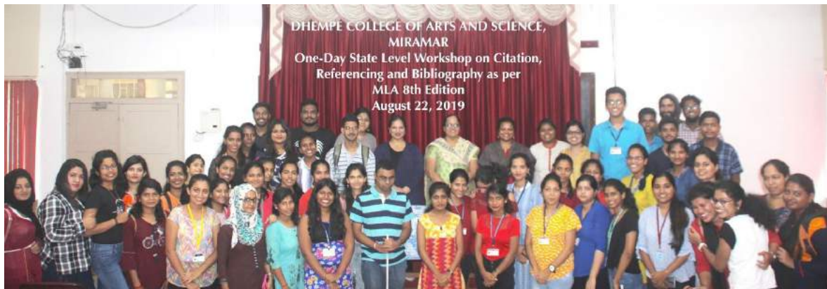
State-Level Student Workshop on Citation, Referencing and Bibliography as per MLA 8 th edition