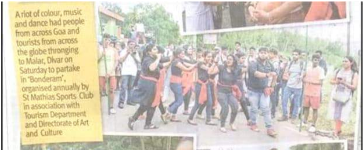
Performance of Students at Bonderache Fest at Diwar Island published in daily newspaper The Navhind Times