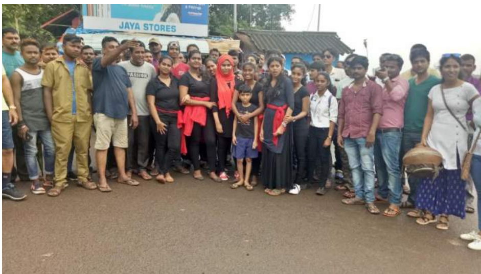
Team with audience at Betim