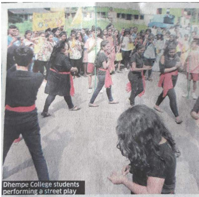
Performance of Students at Bonderache Fest at Diwar Island published in daily newspaper The Goan.