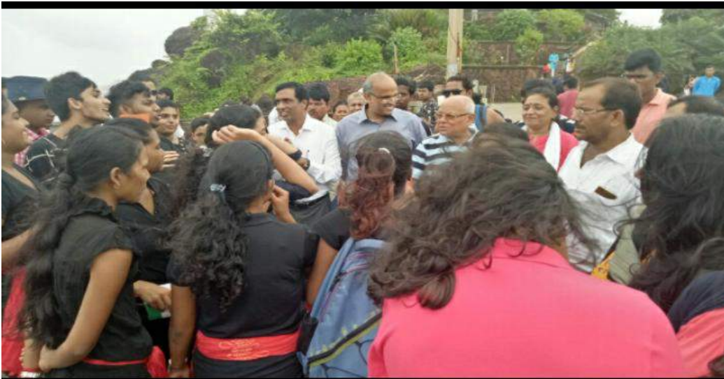
Students interacting with the public at Dona Paula jetty