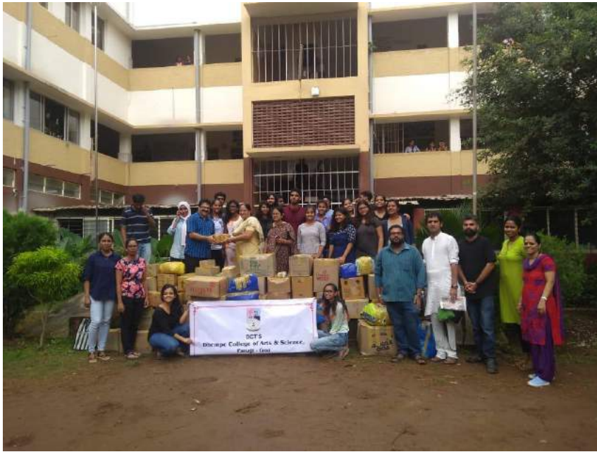
MATERIAL SENT TO KERALA FLOOD RELIEF