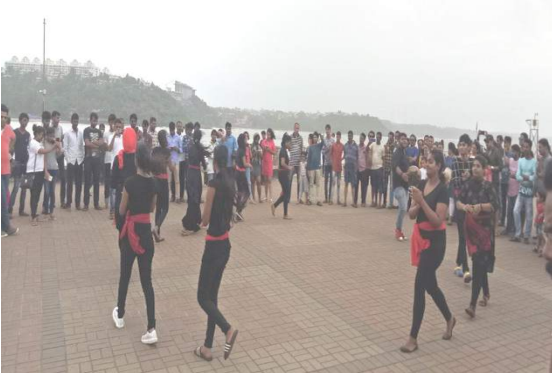
Students performing at Dona Paula jetty