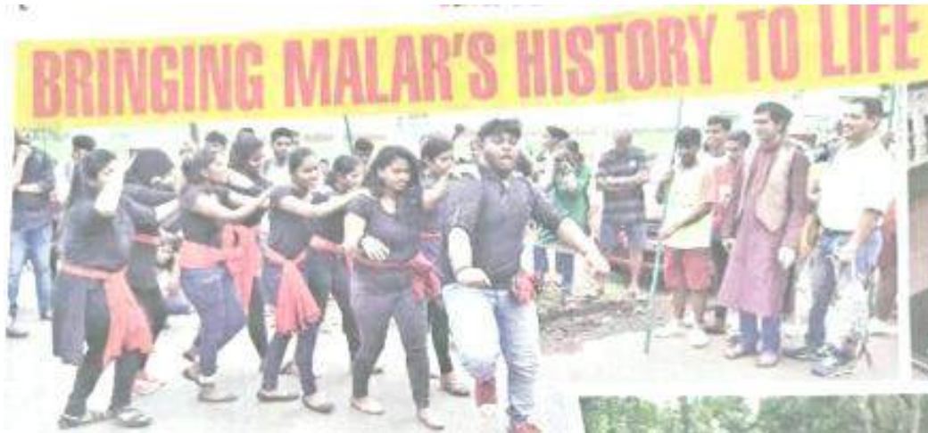
Performance of Students at Bonderache Fest at Diwar Island published in daily newspaper Times of India