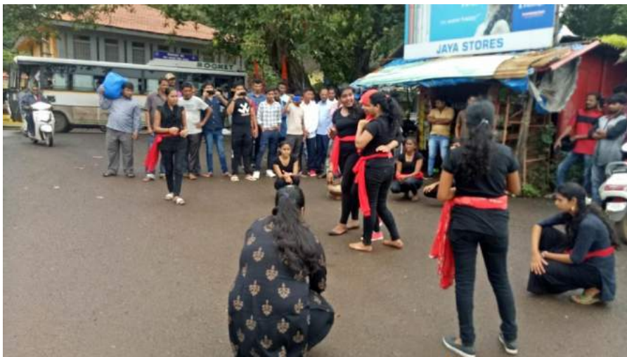
Students performing at Betim ferry Point

people. Students also interacted with the public spreading awareness about different issues. Ms AratiRane(Department of Biotech)also guided the students and accompanied them.