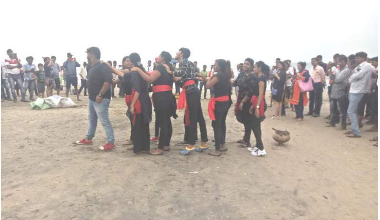
Students performing at Miramar beach.