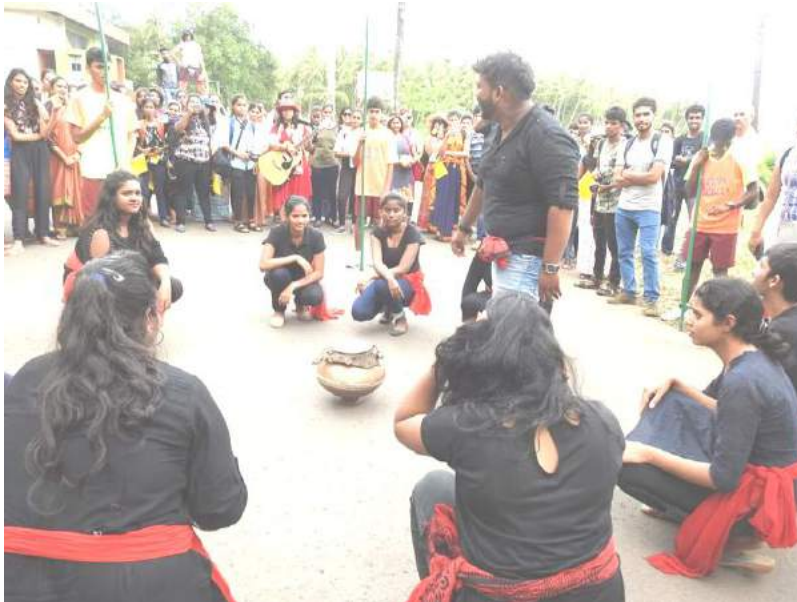
Students performing at Bonderache Fest at Diwar Island

Students performed with their fullest potential to awaken the society to existing social, environmental and cultural issues. With the help of innovative songs, actions and dialogues, the play emphasized the need to protect the Heritage of Goa. The audience enjoyed and appreciated the performance and even pledged to help in changing attitude towards life in Goa. The street play received huge response from the people gathered there's