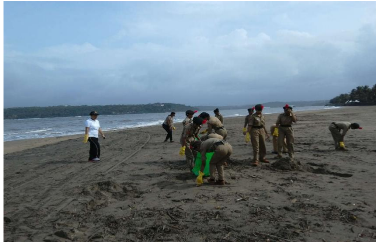
3. Swaccha Bharat activity was held on 13th April 2017 . Cadets cleaned the gymkhana of our college.