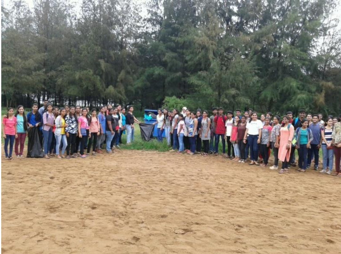
11. Cleanliness Drive – On 19th December 2017, on the occasion of celebrating Goa's Liberation Day, cleanliness drives were undertaken