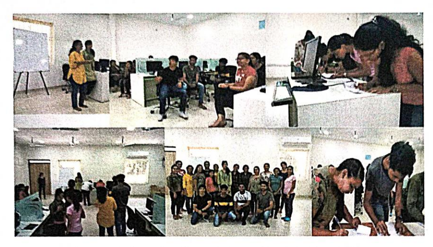
Language Learning through innovative hybrid activities

Total number of hours: 05 Total number of participants:17