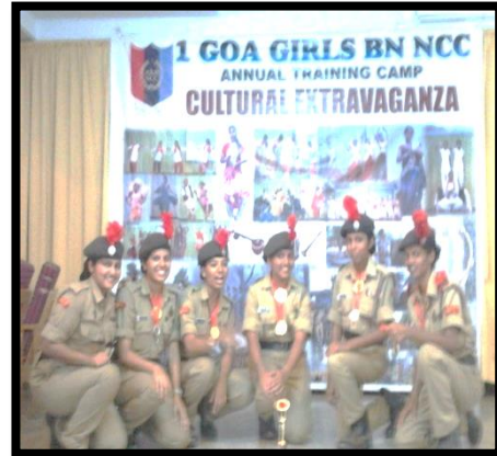
Self Defence Training 2015-16