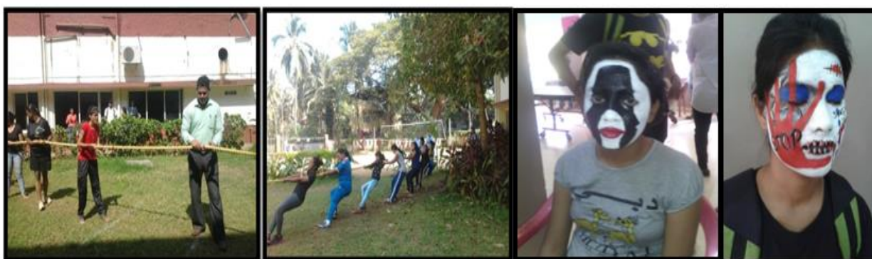
Tug-of-war for girl students

The following are the list of activities/competitions that were conducted for the students on themes related to women’s issues / gender equality. The first two events were held in the month of January 2016.