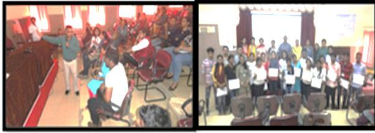
An Inter-Collegiate Quiz Competition on ‘The Contribution of Indian Women’ on 11 th January, 2017 organised by Women’s Cell of the College.