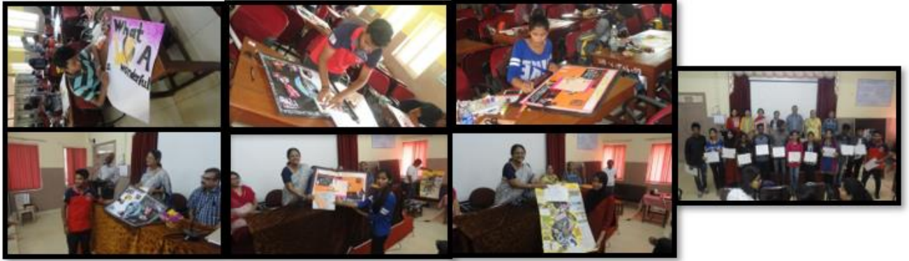
Inter- Collegiate poster competition on 'WOMEN RIGHTS' by Women's Cell on 11 th January, 2017