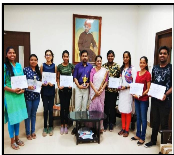
Team ‘Euphoria’ prize winners with nodal officer and Principal

‘Euphoria: Let equality triumph’- 10 th December, 2018.