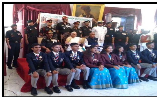
Cadets felicitated at the Governor's house