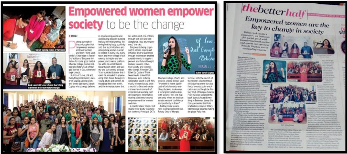
A gender sensitization talk titled 'Claim, not shame your body' on 31/08/2018