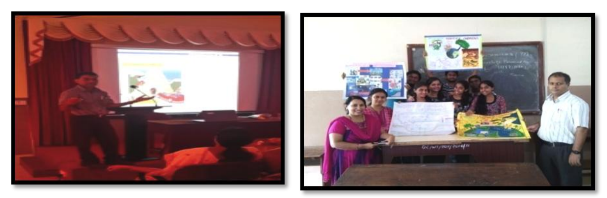
Talk on 'Catalysis in Environment'

c) A poster competition on 'Toxicity of Chemicals on the Environment' for S.Y. B.Sc. students.