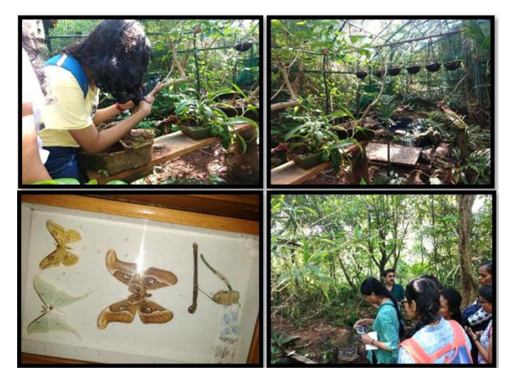
A field trip to Butterfly Conservatory

a) A field trip to Butterfly Conservatory at Priol, Ponda for Green ambassadors on 12/12/2018.