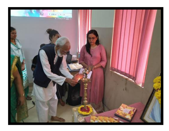
Inauguration of Green Day celebrations by the Chief Guest

the annual Green Day of the college on 29/08/2019. The inaugural session was followed by the tree planting ceremony where all the dignitaries planted saplings in the College campus.