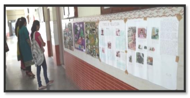
Poster competitiion on 'sustainable development'