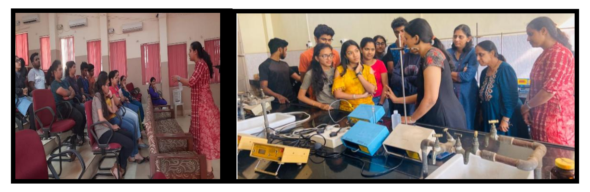
Water quality Analysis-training

conductivity, hardness, acidity and alkalinity. 14 students and 03 teachers participated in the training.