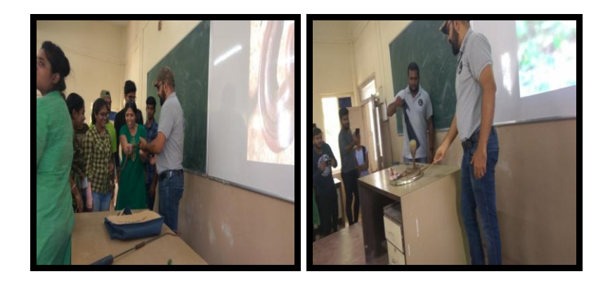
Snake Awareness and Snake Bite Protocol Program