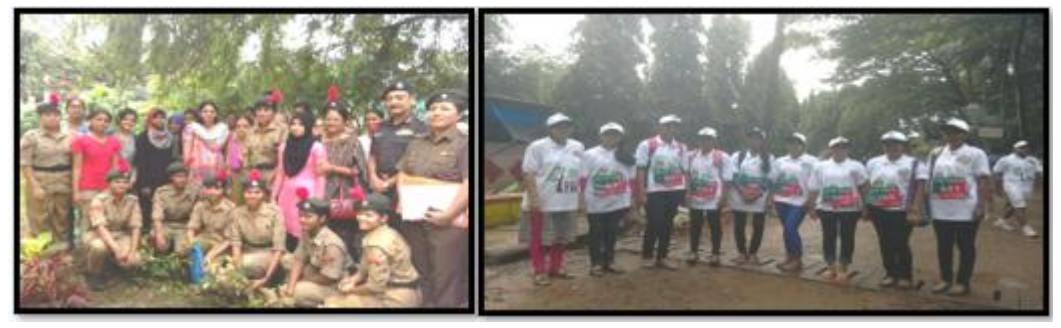
Tree Plantation in college campus