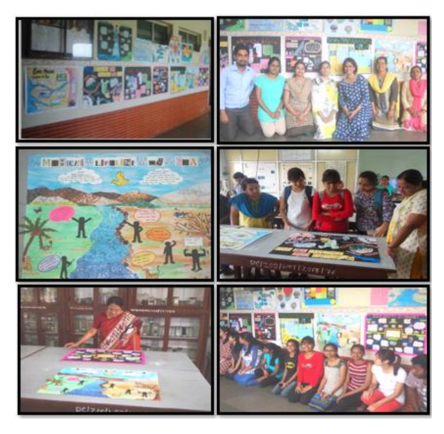
Various ecological shades at Poster competition