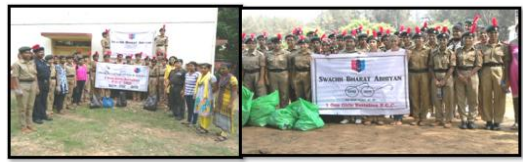
Street Play on Swachh Bharata Abhiyan