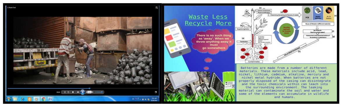
Audio-video editing and e-poster making on environmental issues