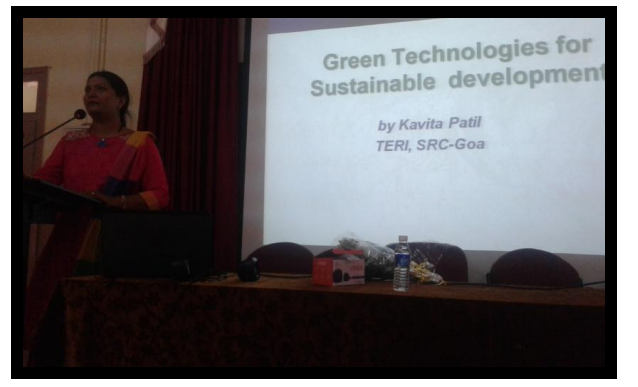
Green Technologies for Sustainable Development