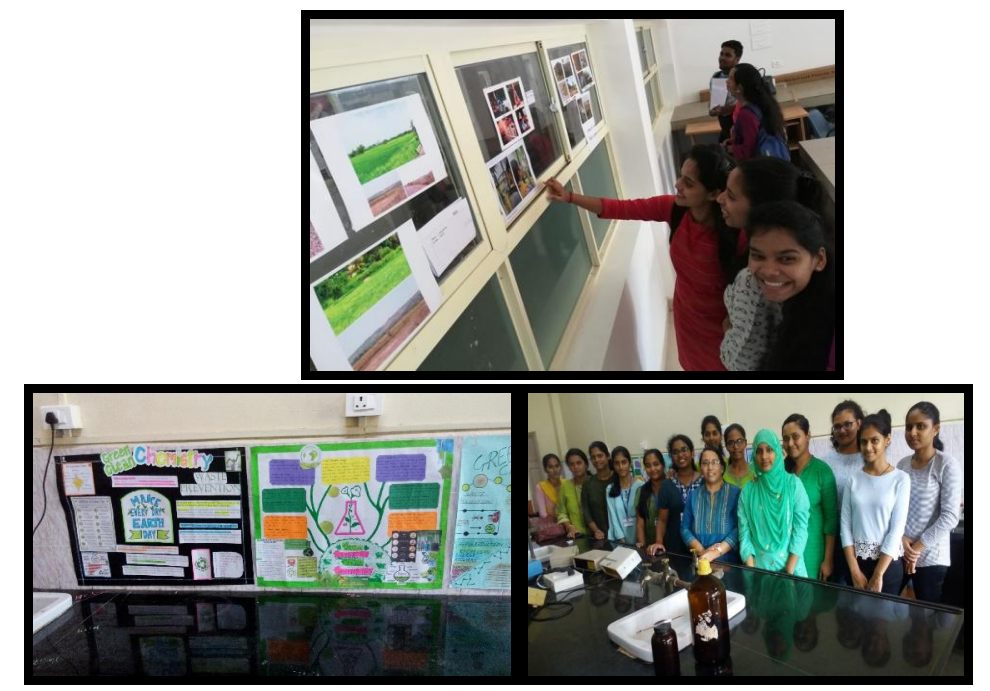
Nature through an ecological lens 28