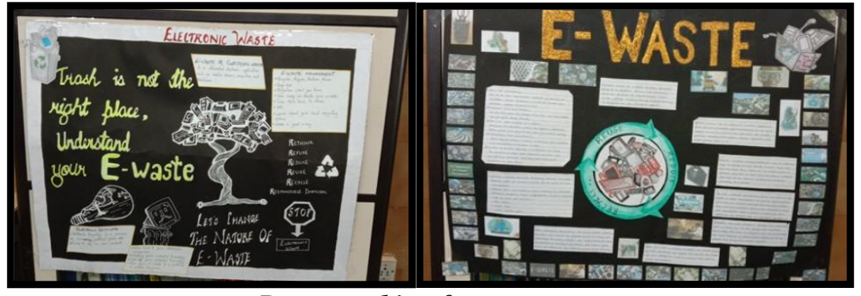
Poster-making for awareness