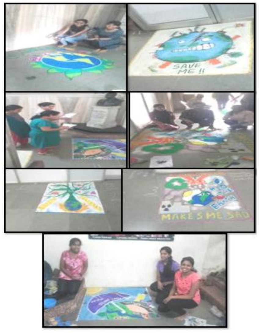
Depicting environmental issues through Rangoli