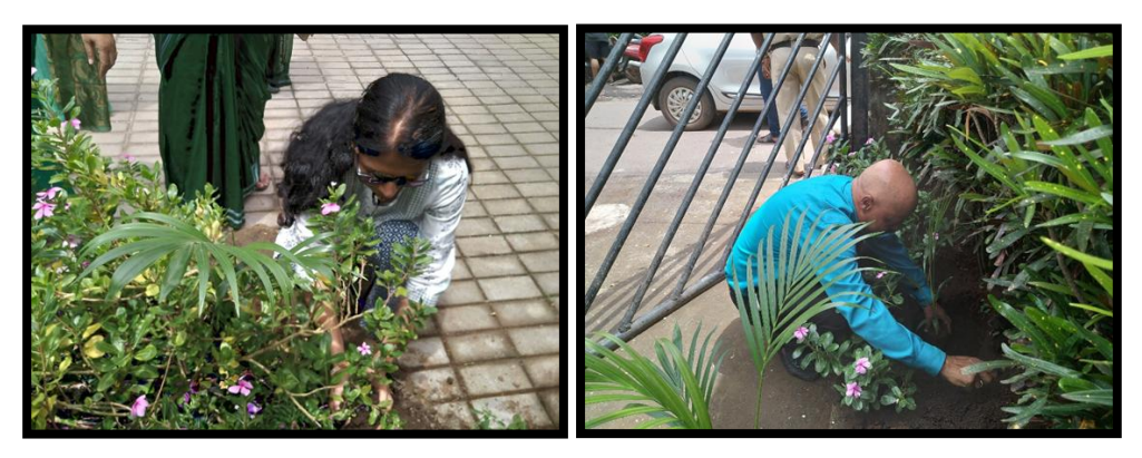
Sapling plantation in the College campus