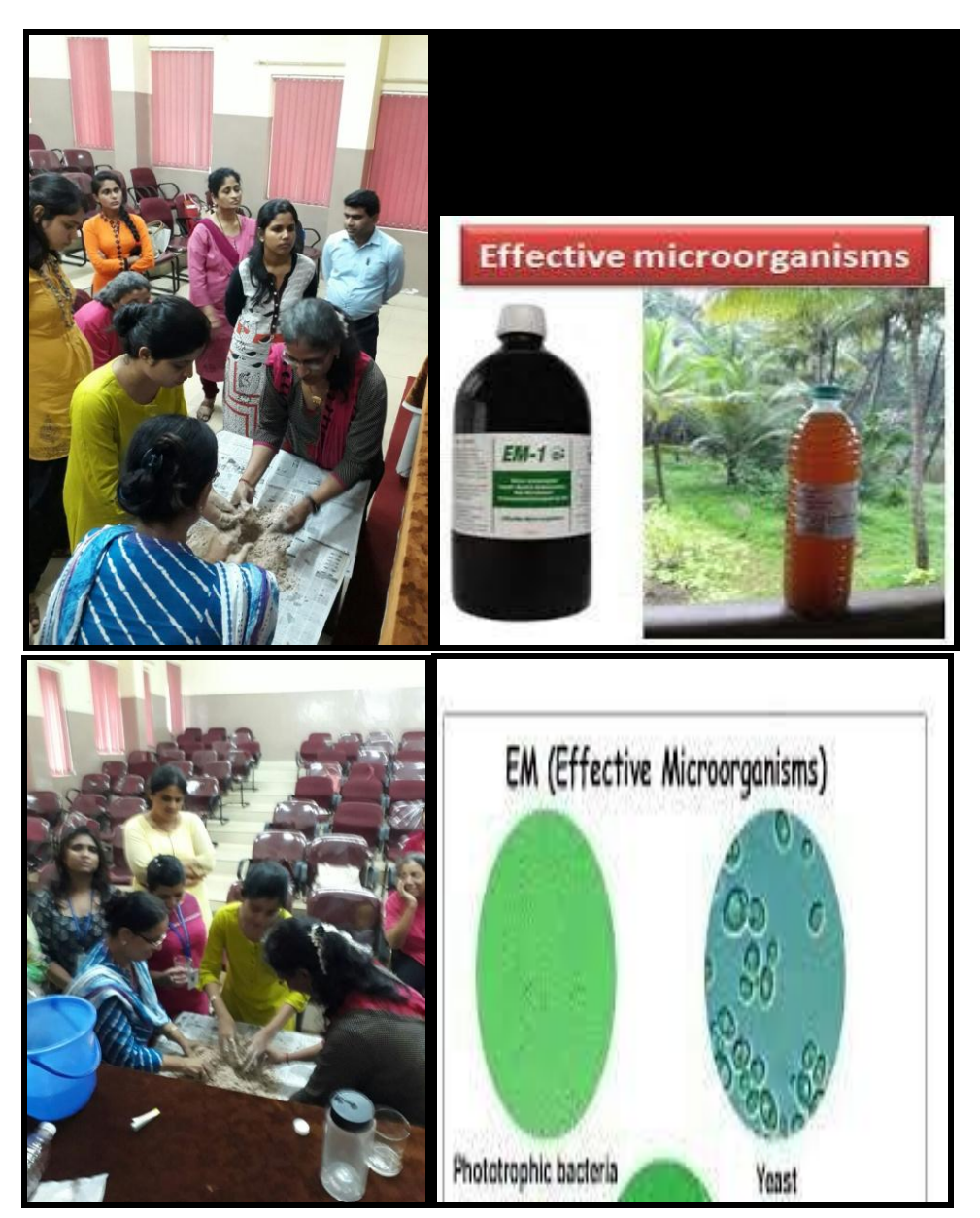
Hands-on workshop on preparation of EM

a) A workshop on Preparation of Effective Microorganisms (EM) for faculty members on 04/10/2017.