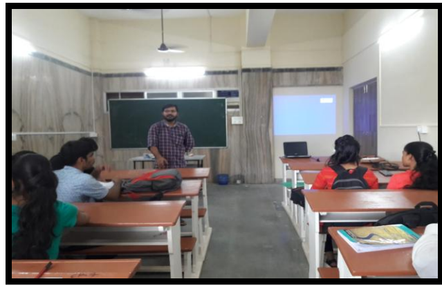
Presentations on 'How to make Chemistry Laboratory Greener