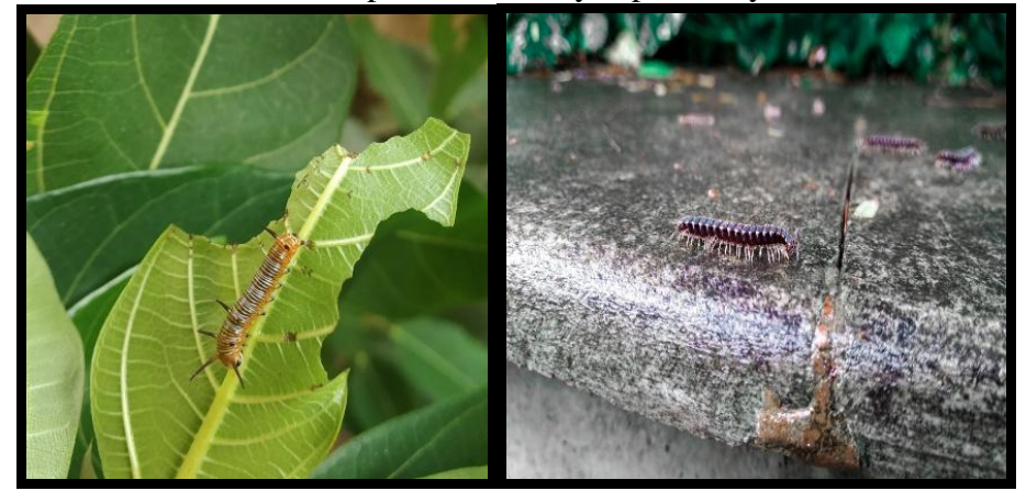
First Place: Pratik Bondnekar

a) two photography competitions entitled 'Dhempe College Wildlife Photo Contest' and 'Plants Photo Contest' under the aegis of the Green Audit Committee, Nature Club and Eco-Club, a National Green Corps program. 25 students participated in these contests which took place from November 2019 to April 2020. Students were required to click pictures of wildlife and plants that are found on the campus. Following is a visual documentation of the campus biodiversity captured by them: