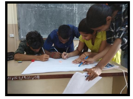
Repurposing and upcycling for the environment

a) a poster-making activity during which students were encouraged to make posters on the theme of Environmental Sustainability . Students were told to recycle and reuse material; posters were made with repurposed craft and chart paper.