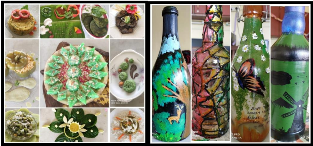
Hari bhari thali