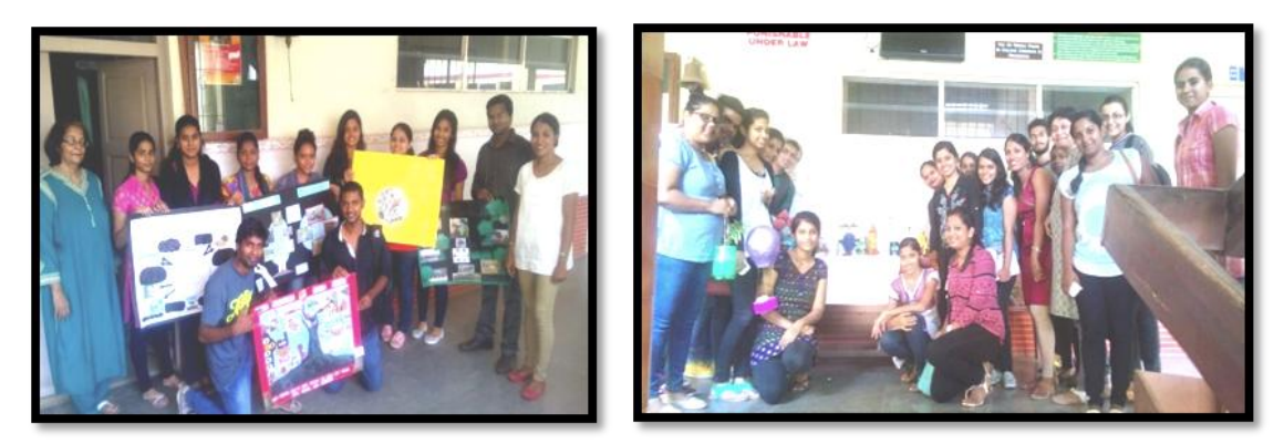
Collage making competition on the topic 'Save Nature Save

e) Presentation on the topic, 'Effectiveness of Religion in Protection of Environment' by students.