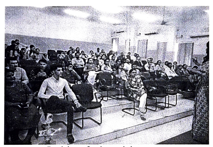
Participant for the workshop