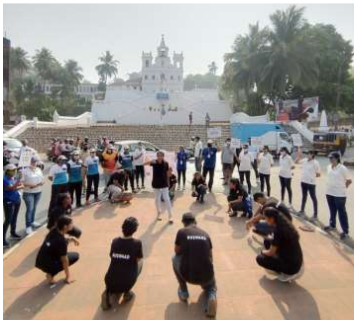
‘Students performing at Church circle of Immaculate Conception, Panjim’