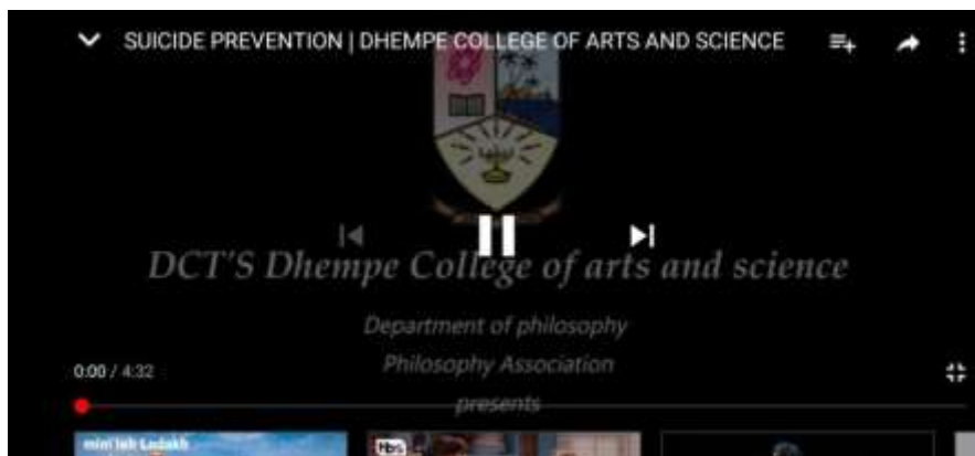
Screenshots of the video on Suicide Prevention by the students of Dhempe College of Arts and Science