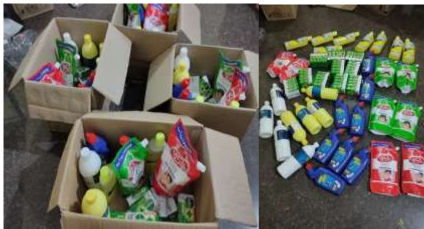
Sanitation products distributed among the under-privileged families