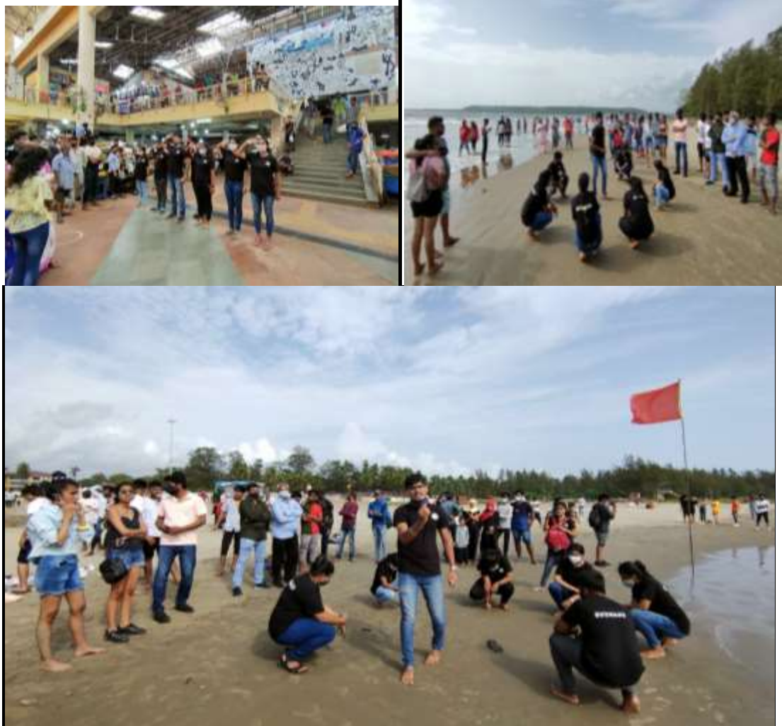
Students creating awareness at Miramar Beach and Panaji Municipal Market