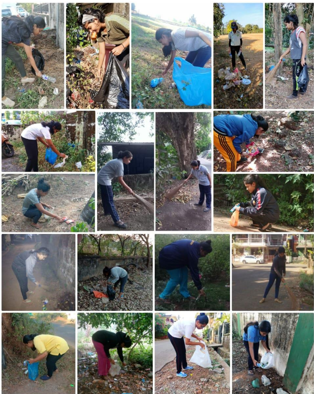
VIII. Cadets of Dhempe college of Arts and Science, Miramar cleaned T.B.Cunha Memorial, Azad Maidan Garden on 9 th December, 2020. Four of them participated.