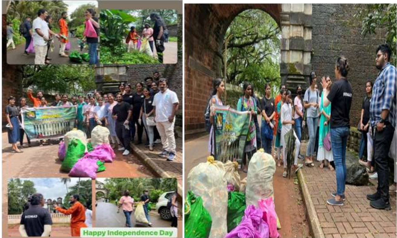
Participants at clean-up Drive