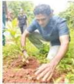
Activity featuring on Local newspaper Herald