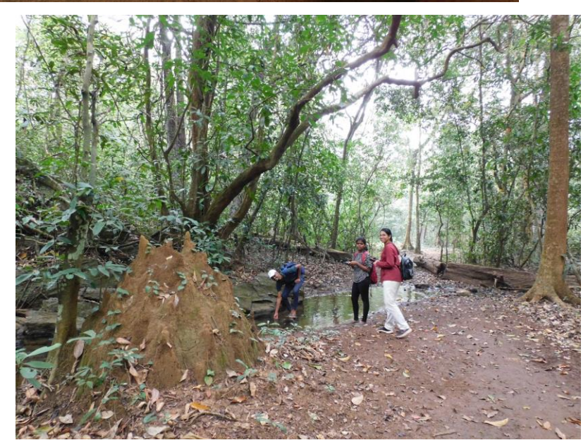
Field trip to Cotigao Wild Life Sanctuary