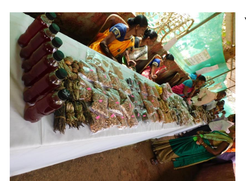
Visit to Lokotsav