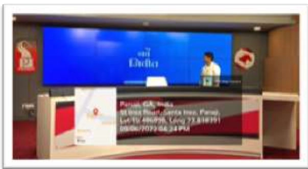
The Technical staff was explaining how to operate the Screen.

A.V.Room: After the interactive session, in the next phase the person in charge explained the various aspects of the Audio-Visual Room. He elaborated on the various components of Audio-Visual such as display, projectors, amplifier, speakers etc. and their synchronisation. Further, it was emphasised on the need of a technical staff to handle the complex procedure.