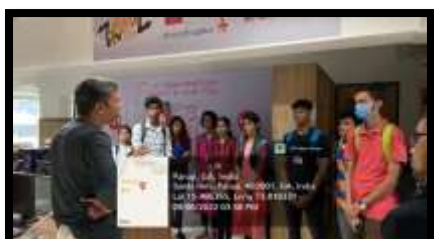
Representative from the Prudent Media having Deliberation with the Students and the faculties.

Interactive session: Before the practical understanding of the studio, the representative from the Prudent Media gave understanding about the theoretical aspect of the subject. Meaning and the importance of Journalism and the way Journalism in Goa perform. The media person also highlighted upon the role played by active citizens in contemporary era. The students expressed their keen interest in knowing about the actual working of the studio.