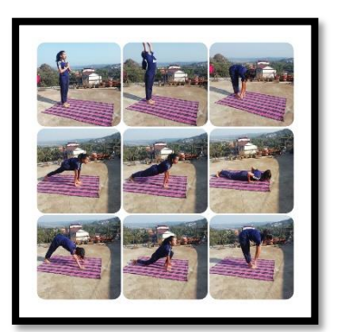
Cadets performing "Surya Namaskar"