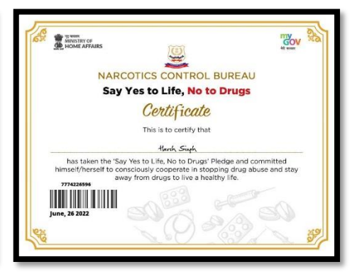
Certificates of participation for fight against drug pledge.