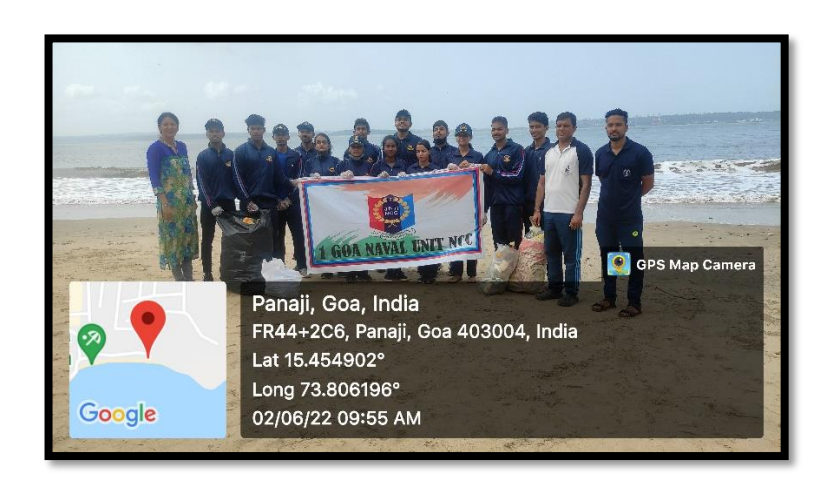
Hawaii Beach Cleanliness Drive

• On 2<sup>nd</sup> June 2022 NCC cadets cleaned Hawaii Beach