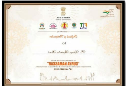
Certificate of participation from Ministry of Aysuh Government of India