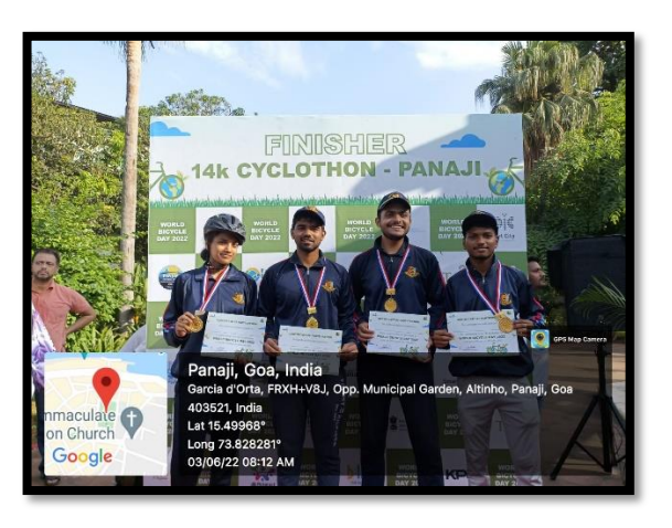
Cadets with finishers certificate and medal -Cyclothon Event

• On 3<sup>rd</sup> June 2022 4 NCC cadets participated in the cyclothon organized by Director of Sports and Youth Affair