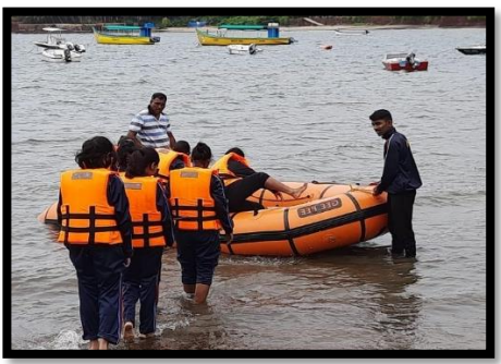
Cadets participating in sailing

• Goa Liberation Day is observed on 19 December every year in India and it marks the day Indian armed forces freed Goa in 1961 following 450 years of Portuguese rule. As the part of 1 Goa Naval Unit NCC Naval Unit cadets participated in Goa Liberation Day celebration ( 19.12.2021 ) at campal Panaji. Cadets performed a Mussal Dance, A dance-cum-song in honor of valiant kings, Mussal-Khel-Pestel, also known as Mussal Dance, was introduced in Goa by the Kadambas.