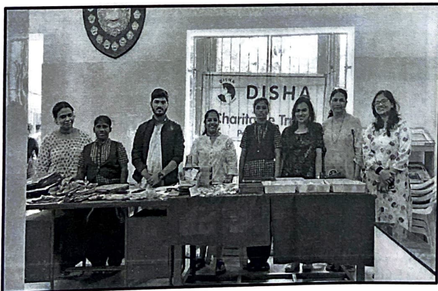
Disha school Exhibition on 28 th and 29 th July 2022